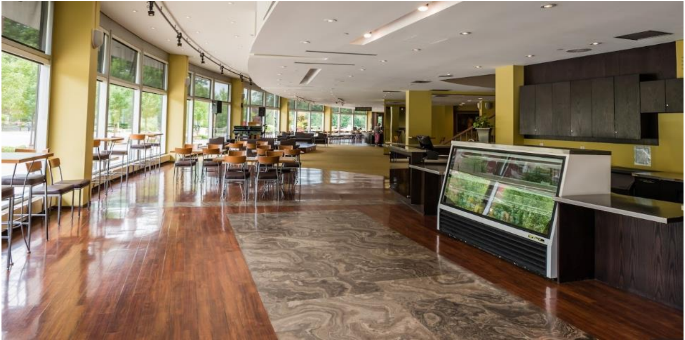
The Festival Theatre south lobby and café with seating.