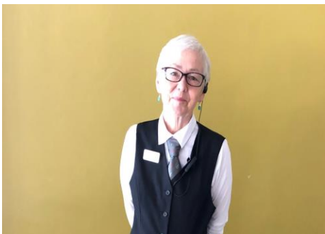
Ushers will be wearing black vests, white shirts, and black pants.

If you have any questions while you are here at the Festival Theatre, please feel free to ask an usher or the House Manager for help. Here are pictures to show what they might look like: