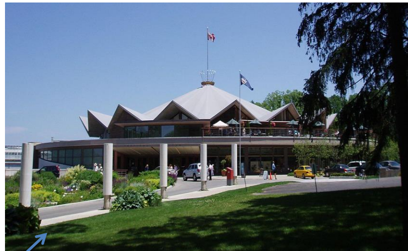
The outside of the Festival Theatre, with accessible doors at the west and south lobbies.