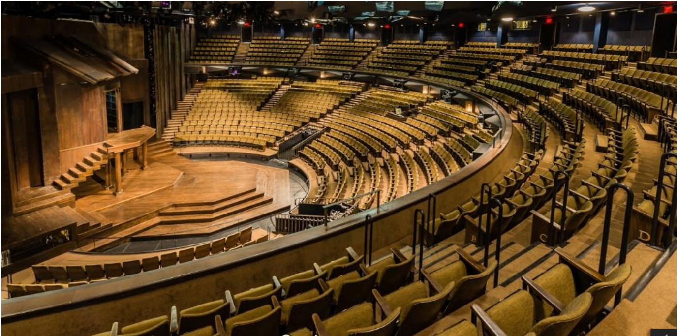
The Festival Theatre stage and auditorium, as seen from the balcony.