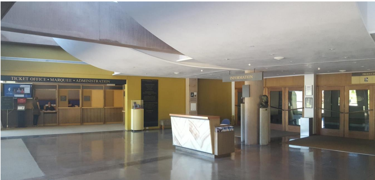
Inside the Festival Theatre's west lobby, you will find accessible washrooms, the box office, the house manager's office and the information desk. Additional washrooms available in south lobby.