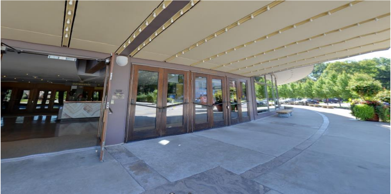
Outside the Festival Theatre, with doors opening into the west lobby.

Enjoy a virtual tour of the Festival Theatre here , or take a look at the photos below.