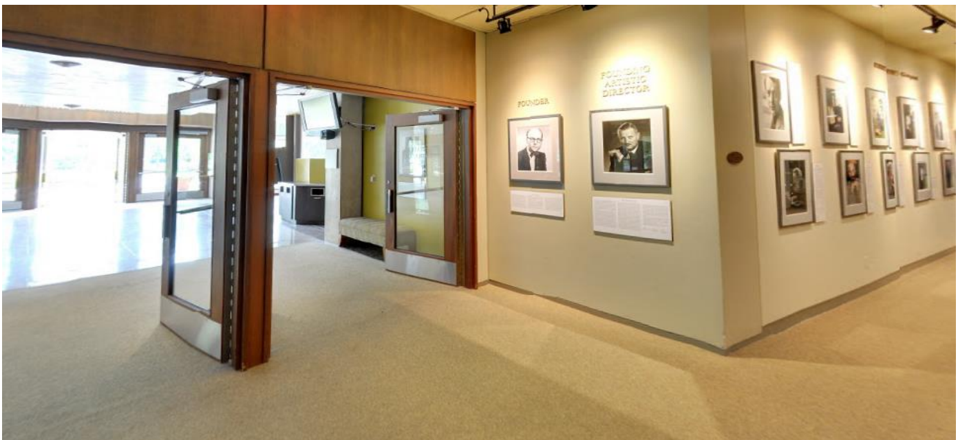
These doors lead you from the lobby into the auditorium.