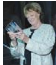
DAME MAGGIE SMITH