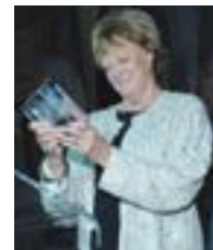
DAME MAGGIE SMITH